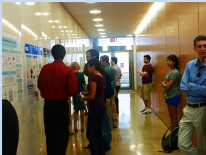
Poster sessions presentations