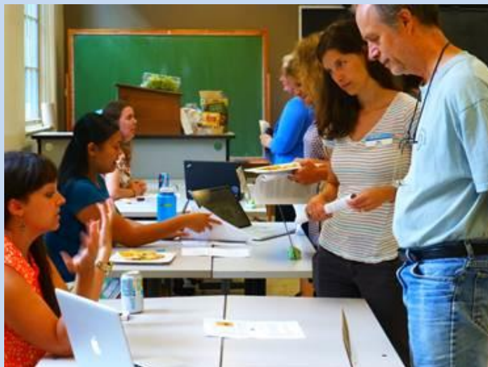
Learning Modules created by HHMI Future Teachers